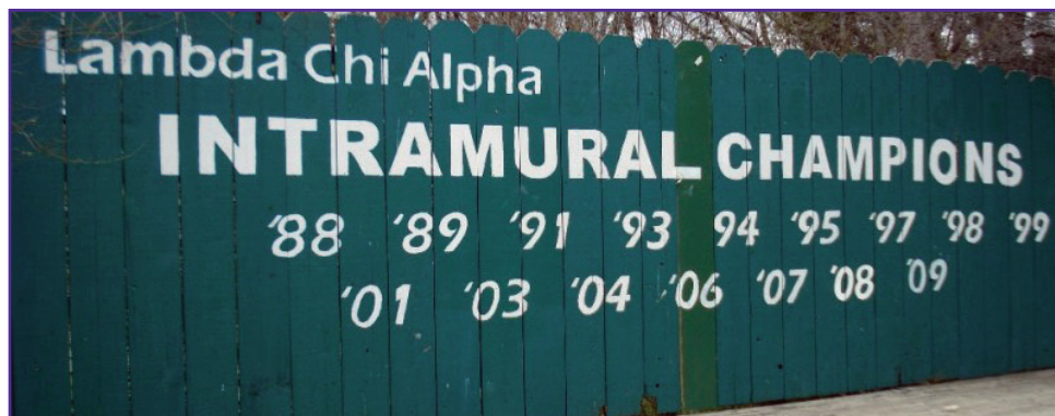
The original west fence surrounding the basketball court at 904 College.