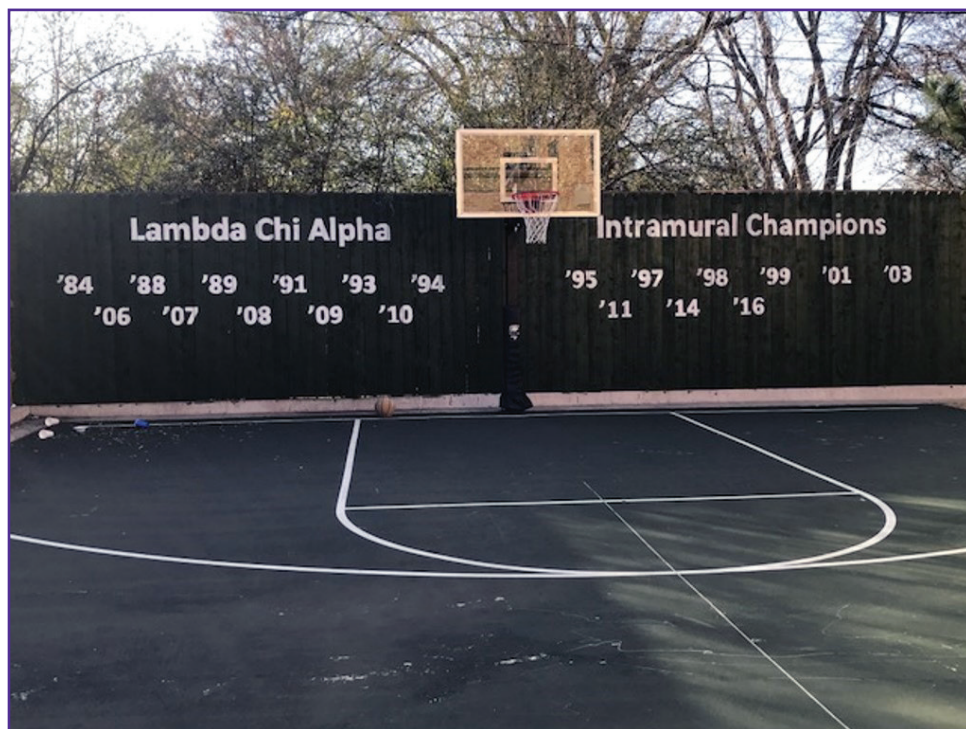
Loyal alumni, parents, and friends of Gamma-Rho Zeta raised the funds needed to rebuild the intramural wall in 2017.