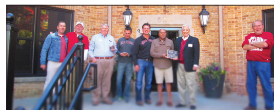
ABOVE: Last fall we honored several alumni who made generous donations to the Building on Our Tradition of Excellence campaign. BELOW: Alumni, undergraduates, family, and friends gathered on November 7 for our room dedication ceremony, honoring our generous donors.