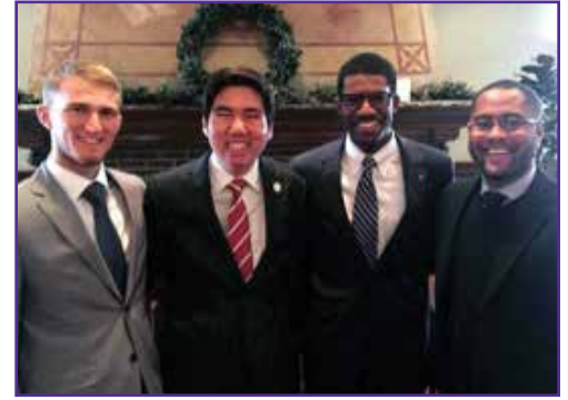
Brothers demonstrate their commitment to academic, philanthropic, and leadership success.