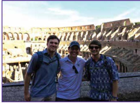
Gamma Rho-Zeta brothers studying abroad and sight-seeing at the Colosseum.

In the community, our members logged just shy of 4,000 volunteer hours last year. In response to our 4,000-hour goal, the Chapter has elected to increase the hours required for membership as we strive to achieve our goal of logging 4,000 hours this coming year.