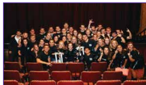
The men of Gamma-Rho Zeta were paired with the women of Gamma Phi Beta for Sooner Scandals this past spring.