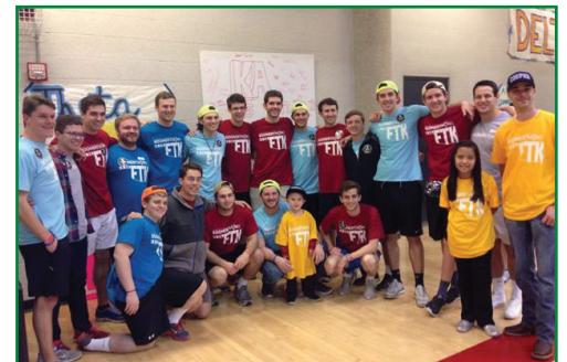
Lambdas with their Miracle Family at Soonerton philanthropy.