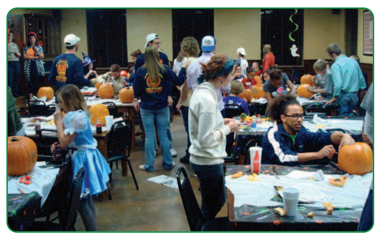
More than 100 Little Brothers and Little Sisters from the Norman area attended the Lambda Theta pumpkin carve. The event also featured carnival games for the children to enjoy.