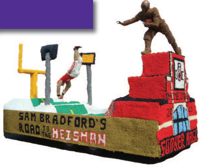
Gamma-Rho won first place in the Homecoming float competition.