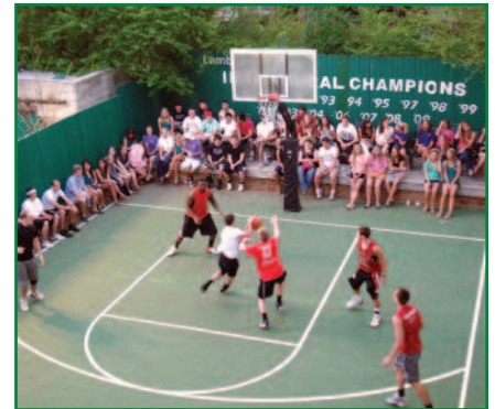
Gamma-Rho and Chi Omega hosted the second annual Swishes for Wishes basketball tournament, which benefited Make-a-Wish Foundation.

Philanthropy projects remain a high priority for the Chapter and we saw great success last year. We hosted the 24th annual White Rose Pageant and raised $4,000 for Big Brothers Big Sisters of Cleveland County. Gamma-Rho co-hosted the second annual Swishes for Wishes basketball tournament at the Chapter House with Chi Omega, benefiting Make-a-Wish Foundation. Additionally, we were actively involved in Big Event, Arbor Day, and other small philanthropic events.