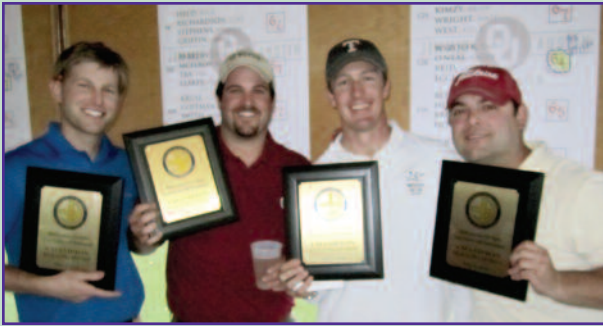
The winning team beat out more than 140 alumni in the four-man scramble tournament.