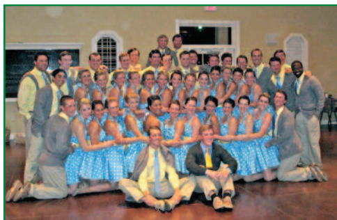
Gamma-Rho paired with Kappa Kappa Gamma for 2010's Sooner Scandals. The two groups will partner again this fall for U-Sing.