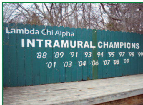
Gamma-Rho earned its 18th intramural championship in 23 years, finishing more than 200 points ahead of the second-place team.