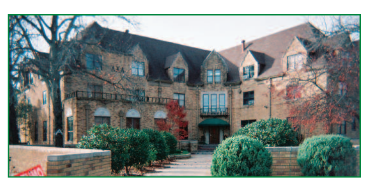
The Chapter House, which has accommodated all Gamma-Rho members, will celebrate its 80th birthday this year.

Of the more than 20 original fraternity houses on campus, over 75 percent have been demolished. Only three remain in use for their original purpose and one of these is scheduled for demolition. The remaining two are the Beta Theta Pi house at 800 Chautauqua and the Lambda Chi Alpha house. Now, at 80 years old, the house has been the only residence for the chapter, housing all of its members. We are the only fraternity on campus able to make such a claim. So as you look at these pictures, or the next time you are in Norman, think about the history of this grand structure and all who have called it home.