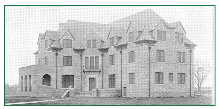
Gamma Rho's first Chapter House was built on land donated by Loyd Harris south of Lindsey Street.

A building boom in 1929 and 1930 produced seven three-story mansions in a variety of architectural styles. All but one was located in the developing neighborhood west of campus on Elm, College, and Chautauqua Streets. This also marked the development of what would become the south oval at OU, with construction of the new library in 1929 at the north end of the south oval.